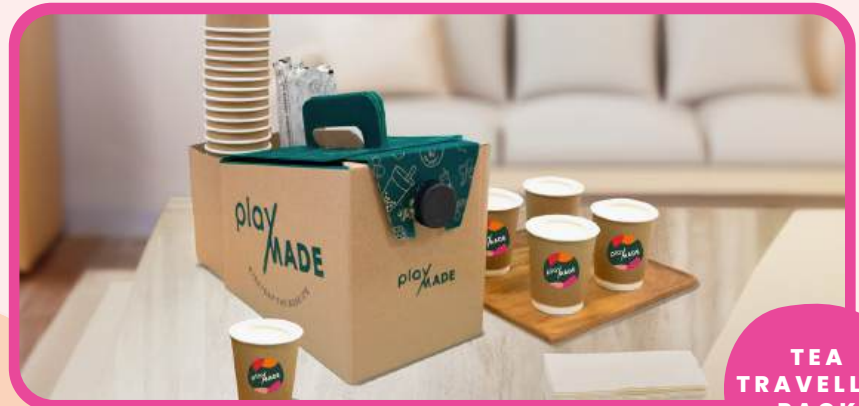
TEA TRAVELLER PACK